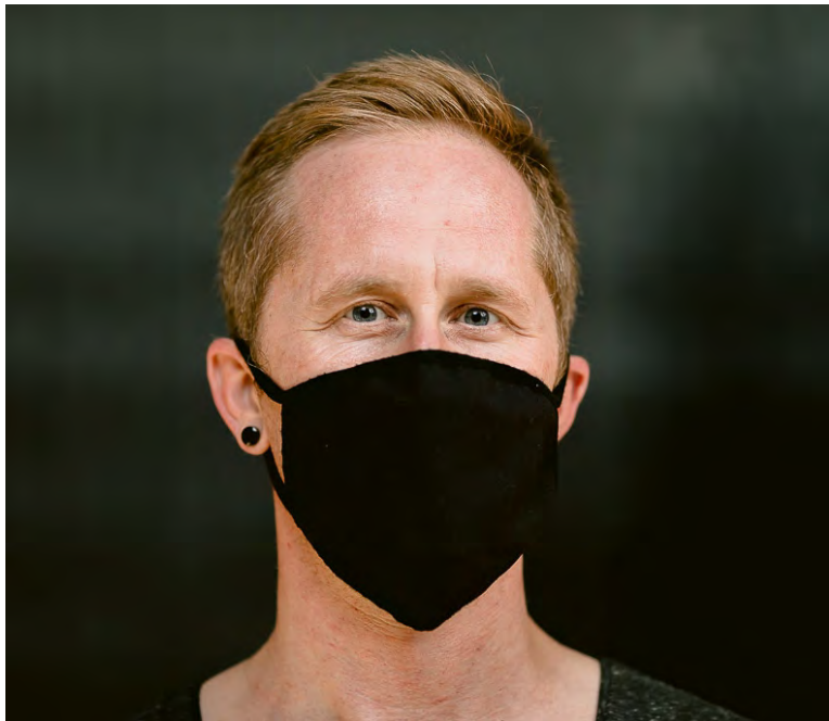
3 PLY COTTON