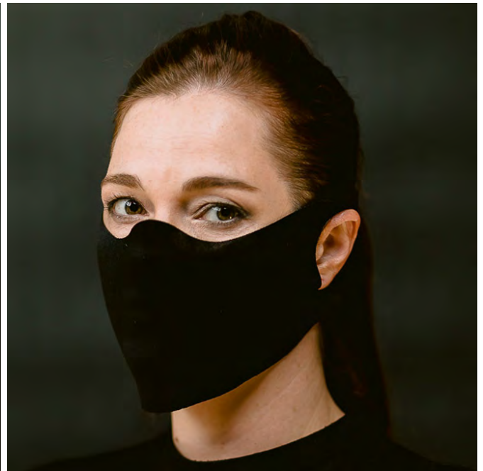
1 + 2 PLY STRETCH

A quality solution for wholesale, corporate gifting or uniformity whether in retail, schools or offices. Produced in South Africa.